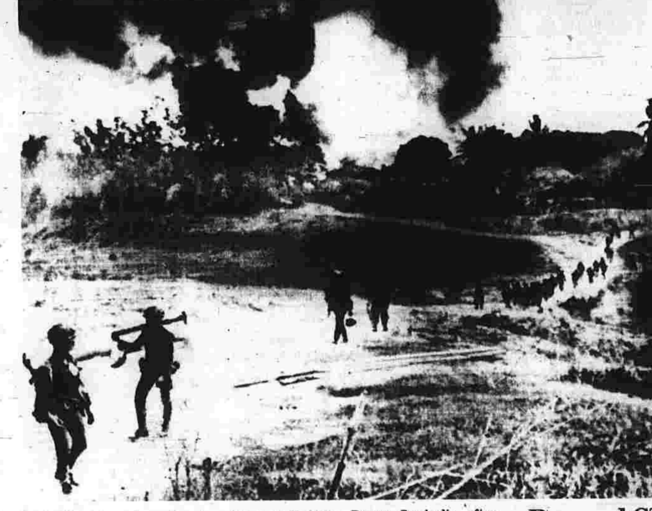
South Viet troops leave burning village of Kompong Reang, Cambodia, after they failed to cut an enemy force there. The village burned in firelight. Meanwhile, on Hill 31 in Laos, the foe overran South Viet unit.