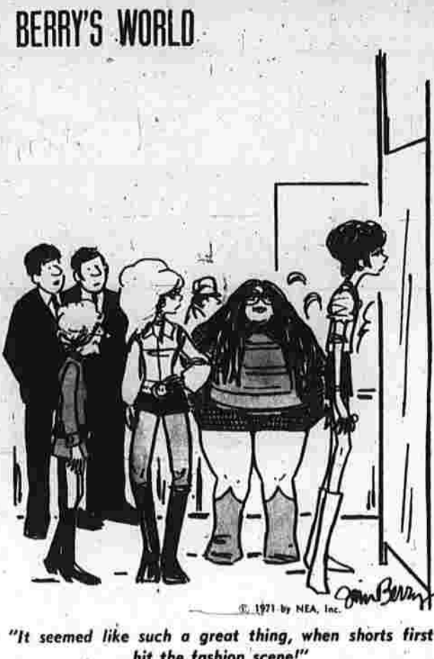
"It seemed like such a great thing, when shorts first hit the fashion scene!"

WANTED - Older country home to rent, 3 or 4 bedrooms, will redecorate and make repairs. Family of 5, very good references. Call 872-9819 after 9 p.m.